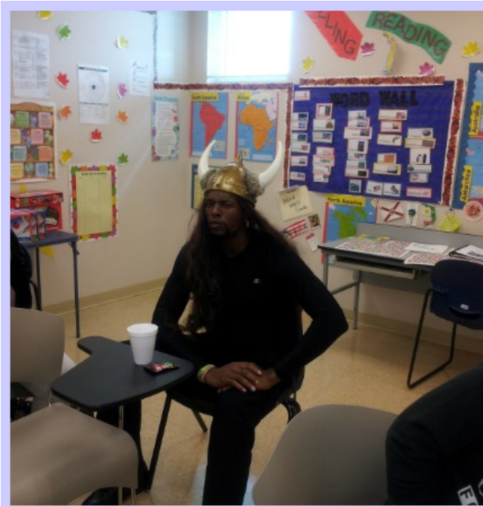
EDU 203 student "LT" aspired to be a viking for the day!